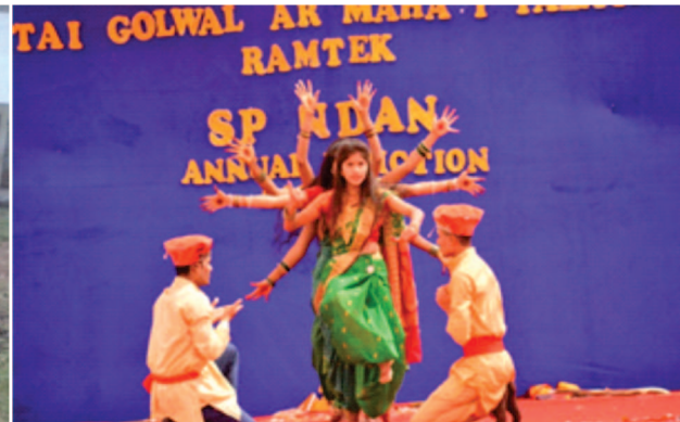
College Annual Day