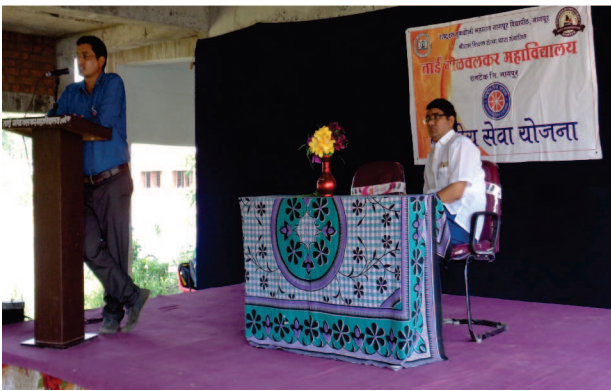
NSS Foundation Day