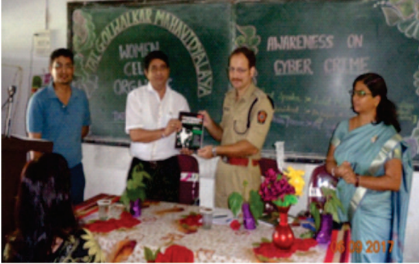
Awareness on Cyber crime