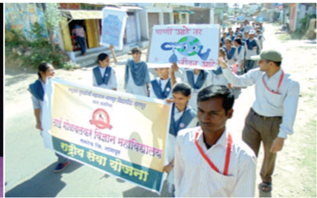
Water Rally by NSS